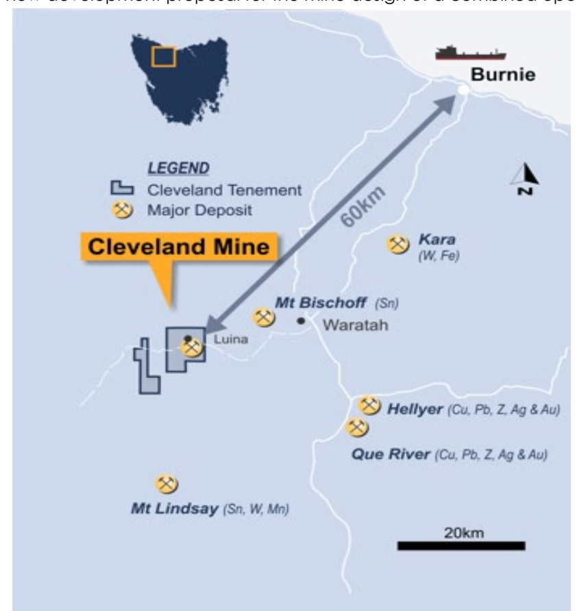
Figure 2. Cleveland Project Location

Work continues at Cleveland on identification of additional exploration targets and an official submission of the new development proposal for the mine design of a combined open cut/tailings retreatment project.