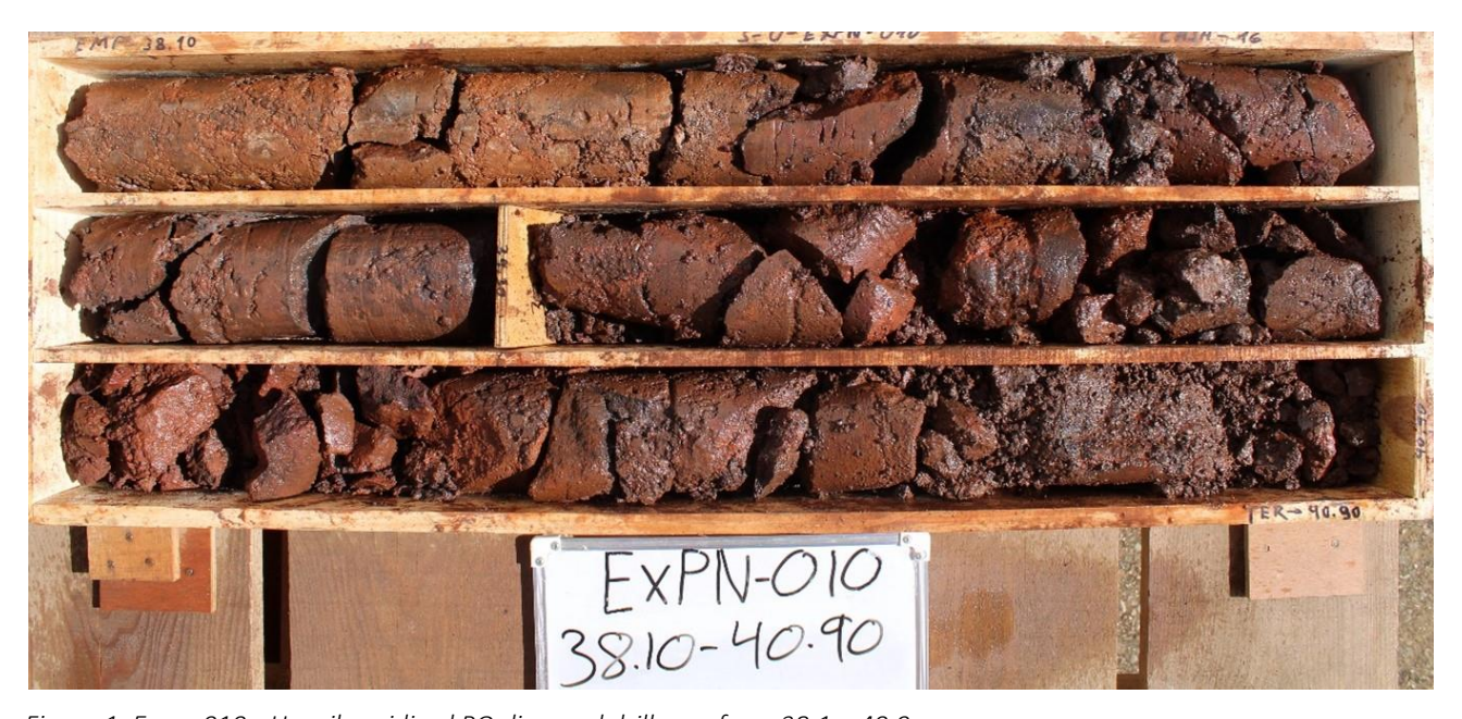
Figure 1. Expn_010:- Heavily oxidised PQ diamond drill core from 38.1 – 40.9m.

Expn_010 has been designed as a resource conversion drill hole, from existing Inferred Resources (*1) to Indicated Resources and to confirm earlier reported geological resources (SEDAR 2014 under Eurotin) omitted from the current 2017 resource model (*1)