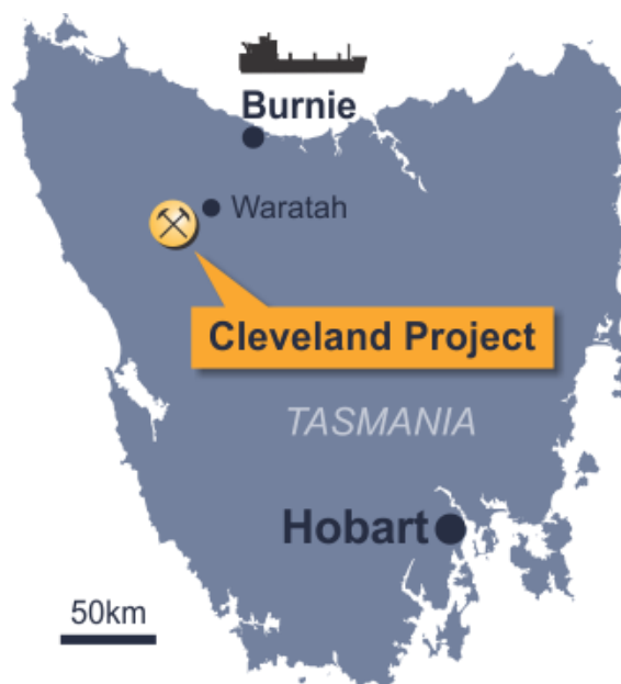
Figure 1. Cleveland Project Location

The Company also commenced an enhanced metallurgical test work programme targeting improved tin recoveries and concentrate grades from the hard-rock and tailings resources.